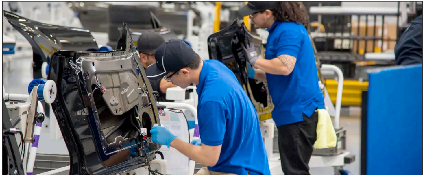
Workers build doors at the sub-assembly section of the Karma Innovation and Customization Center in Moreno Valley.

The bill passed the Assembly in May and survived the Senate appropriations committee last week, but must win final approval in the Legislature by Aug. 31 to reach the governor's desk. Startup costs would be at least $4.5 million with $1.2 million in annual expenses after that, according to the bill analysis, making it trickier to pass amid the state's $47 billion budget deficit.